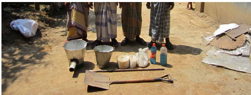
Figure 1 | Simple tools currently used for pit emptying.

To determine the volume of fecal sludge that needs to be transported, the performance of a sample of latrines was studied. Data on the performance of 30 pits was used as the basis for estimating sludge accumulation rates. First, data from six single pit latrines was collected during June 2014 in Bhaluka. A two-stage selection process was used: first, six unions within the subdistrict were selected, and then one household with a pit latrine in each of the selected unions. The budget for studying pits was modest, consequently unions within Bhaluka were purposively selected on the basis of known geology, to provide some variation in the quality of sludge. Households were purposively selected because