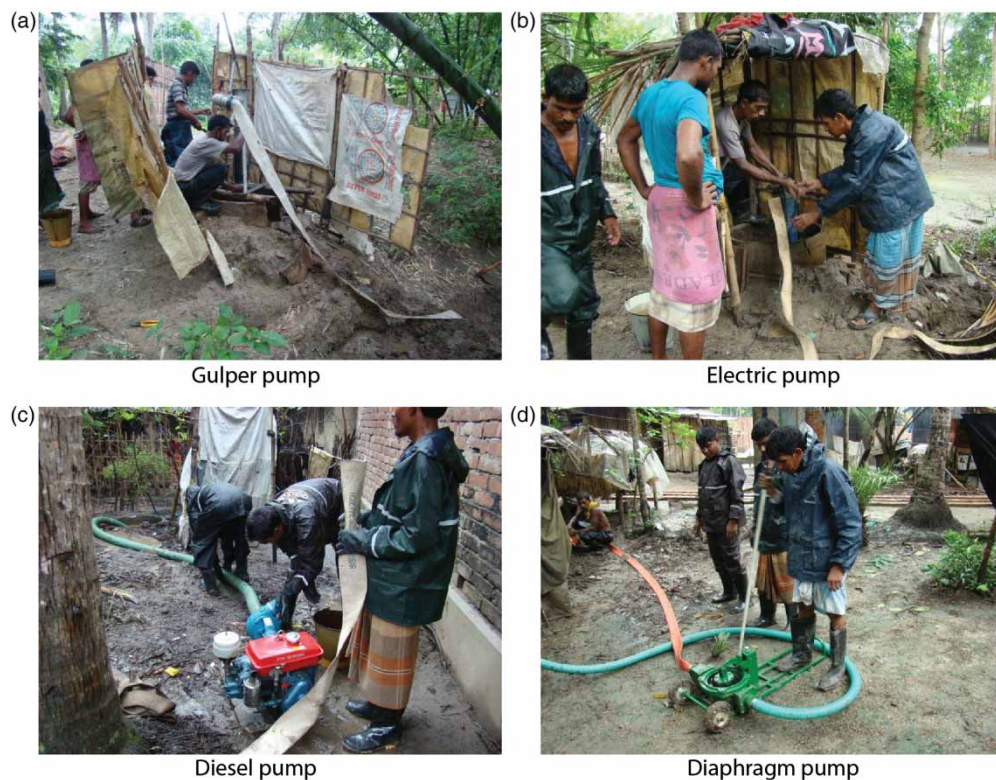
Figure 3 | Pumps chosen for testing.